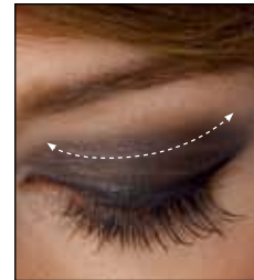
Dramatic: Add a darker shade along upper lash line.