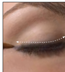
Eyeliner: Apply as close to lash line as possible.