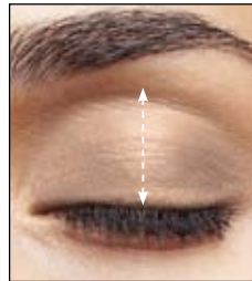
Quick & easy: A wash of color all over.