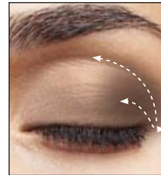
Classic: Blend in a darker shade.